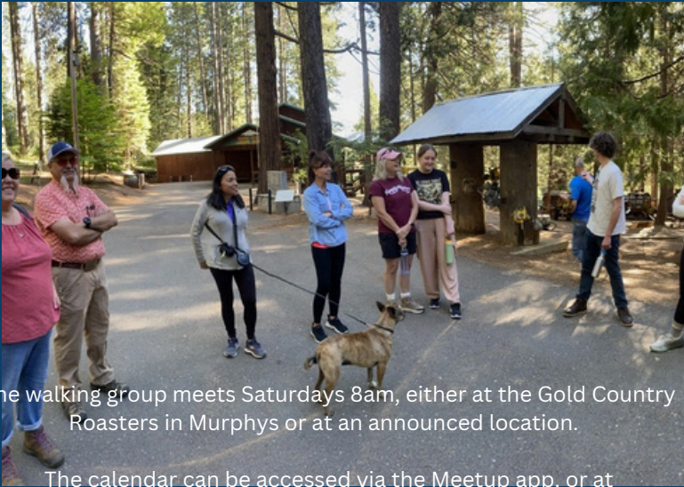
The walking group meets Saturdays 8am, either at the Gold Country Roasters in Murphys or at an announced location.

The calendar can be accessed via the Meetup app, or at www.meetup.com , and search for Murphys walking group.