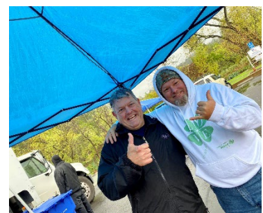
WE HELD SHREDFEST IN THE RAIN AND STILL RECYCLED THOUSANDS OF POUNDS OF PAPER AND ELECTRONICS!