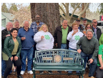
WE INSTALLED A BEAUTIFUL MEMORIAL BENCH IN MURPHYS PARK IN HONOR OF OUR DEAR DEPARTED KING.