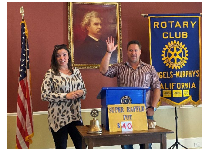
WE HEARD FROM MANY ENGAGING GUEST SPEAKERS