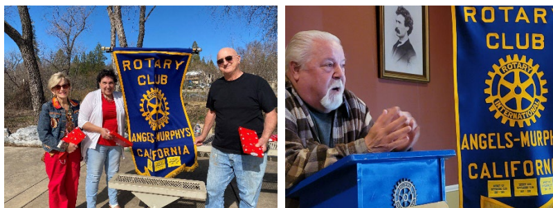
WE GAVE VALENTINES TO VETERANS AND HEARD FROM OUR OWN MEMBERS ABOUT THEIR MILITARY EXPERIENCE