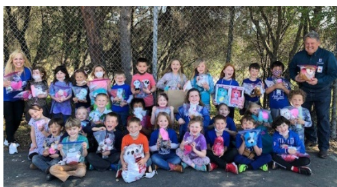
WE STARTED A "CUDDLES FOR KIDS" PROGRAM