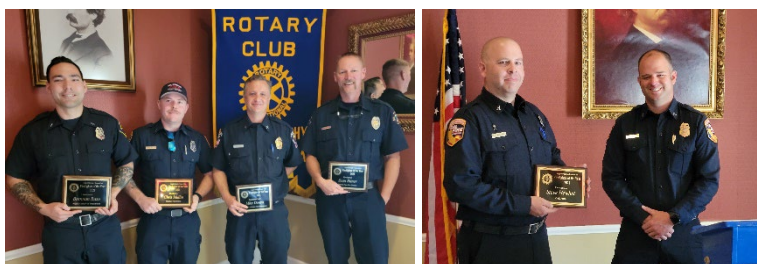
WE HONORED FIREFIGHTERS OF THE YEAR