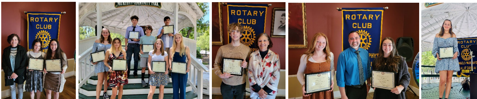
WE HONORED SO MANY FANTASTIC STUDENTS AND GAVE $6,000 IN SCHOLARSHIPS!