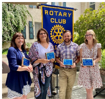
WE RECOGNIZED TEACHERS OF THE YEAR AS WELL AS OFFICERS OF THE YEAR, INCLUDING K-9 VALKYRIE