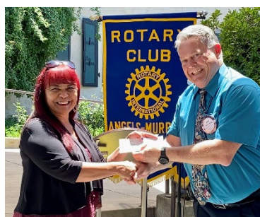
WE DONATED OVER $12,000 TO MEALS-ON-WHEELS