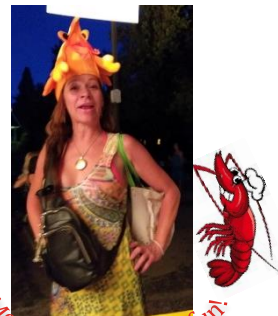
More shrimp feed fun!